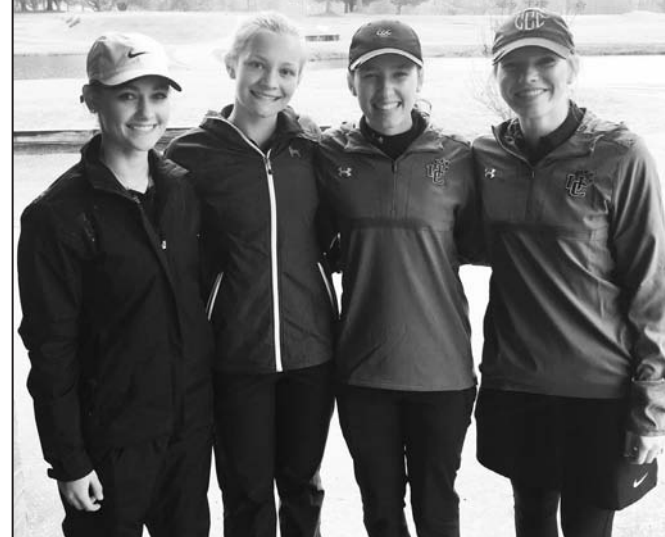
Union County Lady Panthers from earlier in the season.

HELEN - The Union County girls golf team edged Gainesville High and White County at Innsbruck Golf Club last week.